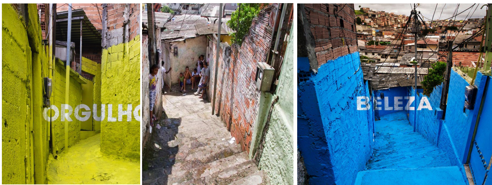
Intervention in Sao Paulo favelas. Boa Mistura Group

NOTES: The student will have to be able to manage in one of the Acrobat -Photoshop- environment programmes and will be provided with the links to download the NCS digital palette.